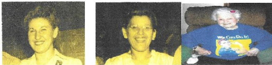
These are a few of our church family's Rosies!

Please visit our tribute to the Rosies at the Rosie the Riveter Rose Garden in the front of our church.