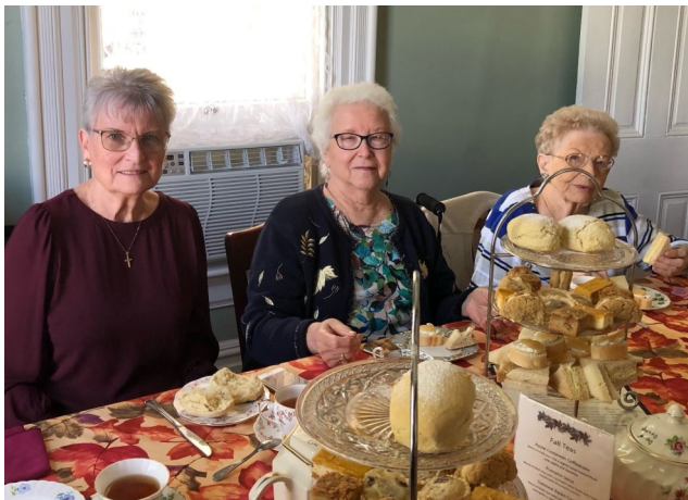
Photos from our October Tea at Tea Trolley in Delta PA