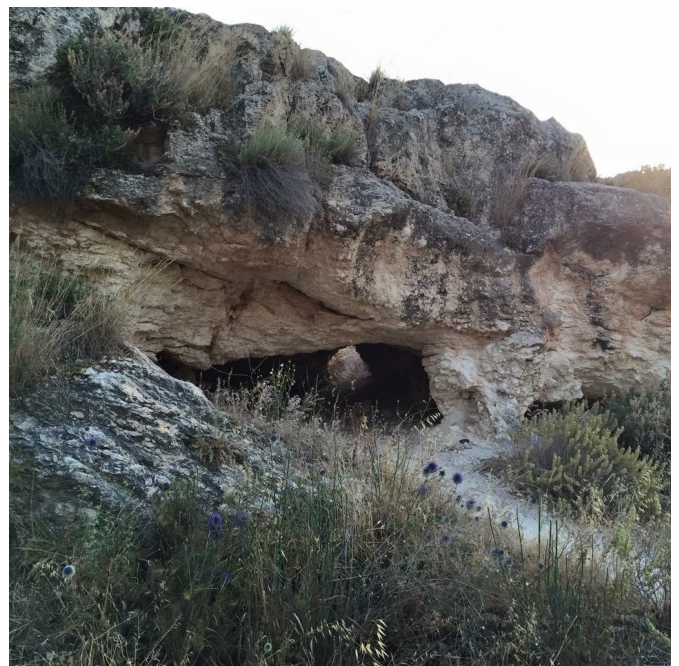
Tomb in Israel