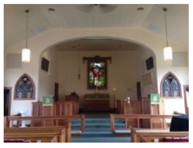
Warm Wall color brings out the richness of the wood