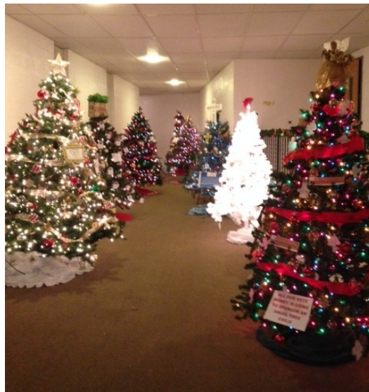
HALL OF TREES

While the weather may have held back some visitors to our event, we were able to enjoy the evening. The Hall of Trees was a delightful entrance to the Marketplace.