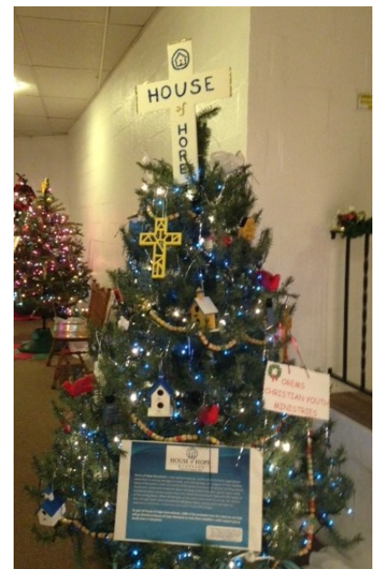
The Winning Tree— OCYM Tree for House of Hope