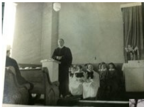
Closing Service in the Church built in 1859.