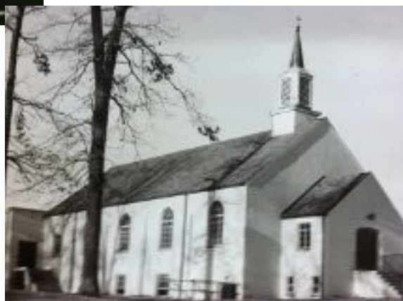
Orem's Church built 1950 and dedicated in 1956.